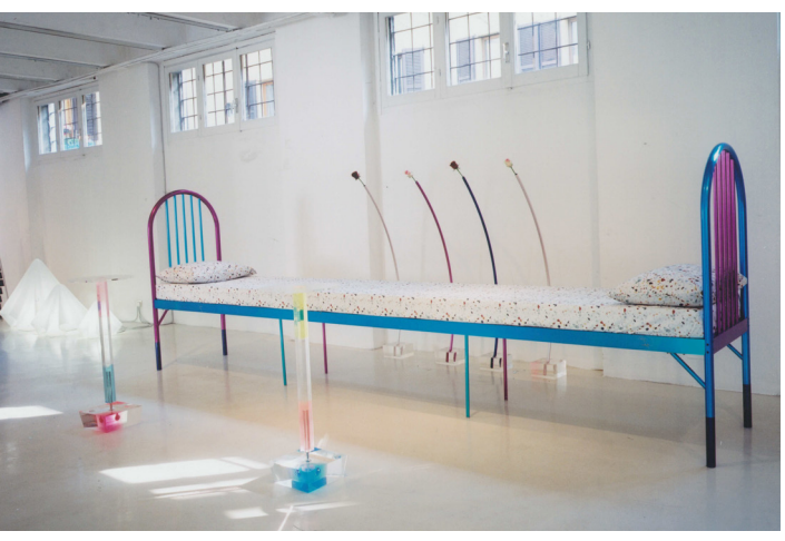
10 Shiro Kuramata 9 april - 11 may 2003