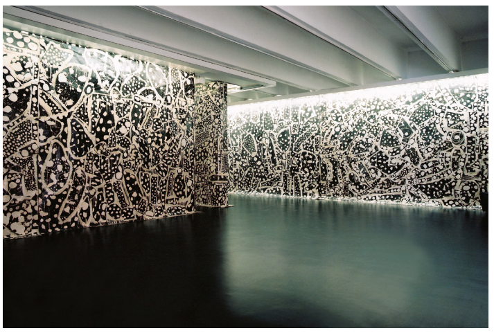
18 Kris Ruhs "One Room" 11 april - 5 may 2002