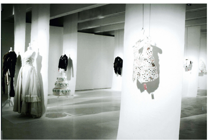
16 Maison Martin Margiela 10 february - 4 march 2007