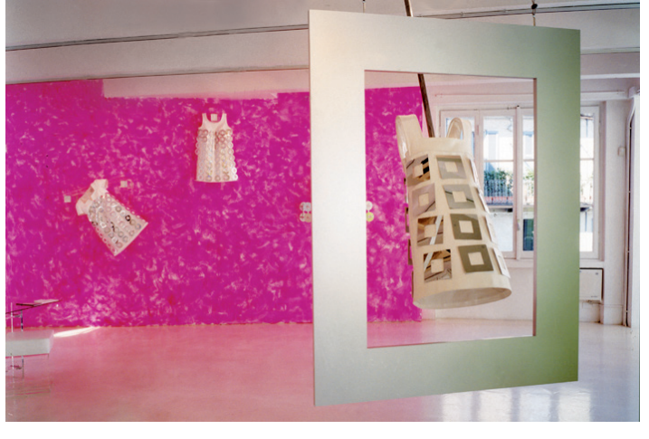
14 Courregès 4 march - 3 april 1999