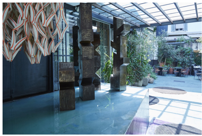
02 Gallery entrance 2016