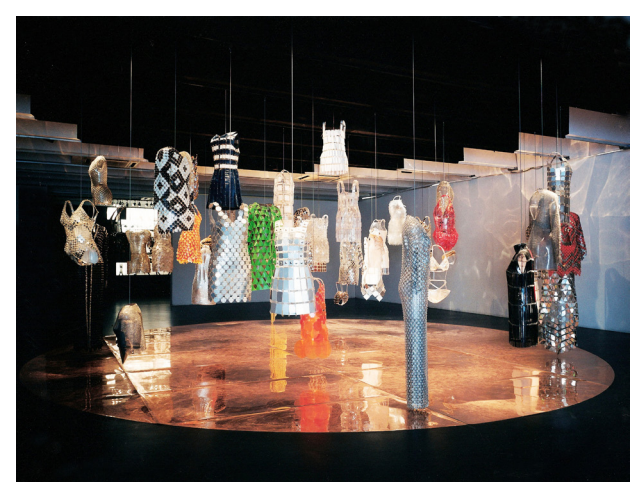
15 Paco Rabanne 25 september - 3 november 2002