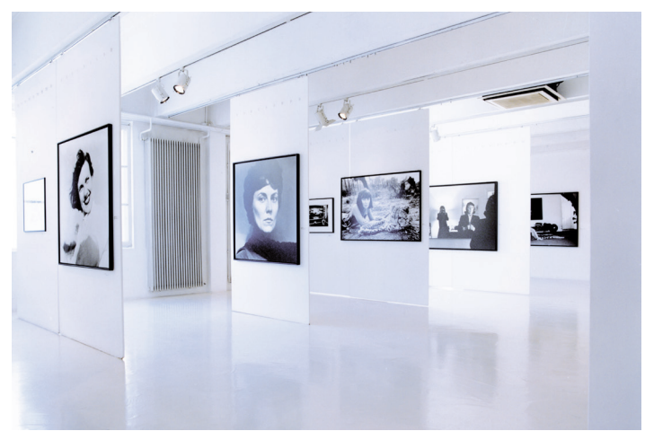
06 Alice Springs, Helmut Newton 29 september - 7 november 1999