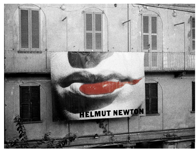
05 Helmut Newton 3 october - 10 november 1996