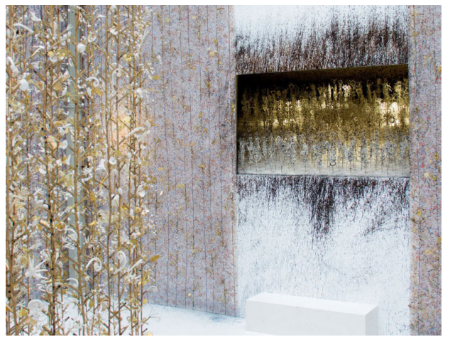
20 Kris Ruhs "Hanging Garden" 11 - 26 april 2015