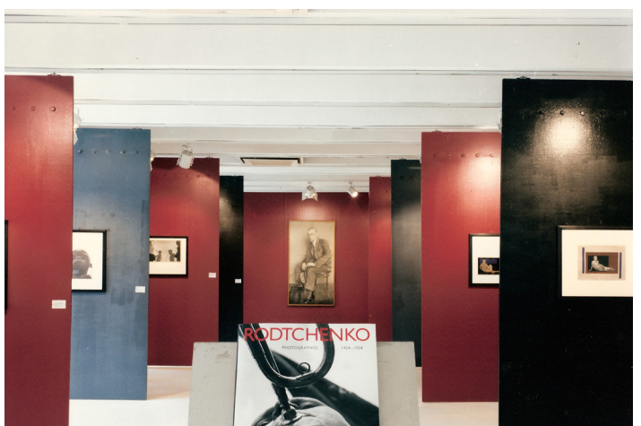
Alexander Rodchenko7 march - 14 april 1996