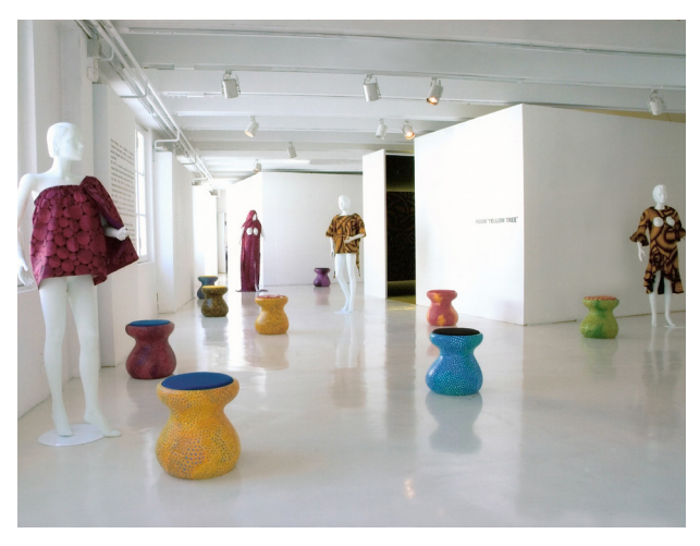
11 Yayoi Kusama 13 april - 1 may 2005