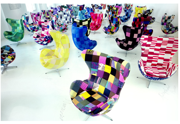
12 Arne Jacobsen 15 - 27 april 2008