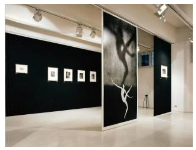
03 Frantisek Drtikol 1 - 31 december 1995