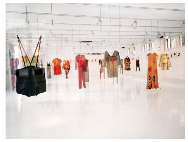
13 Omaggio a Rudi Gernreich 8 october - 15 november 1998