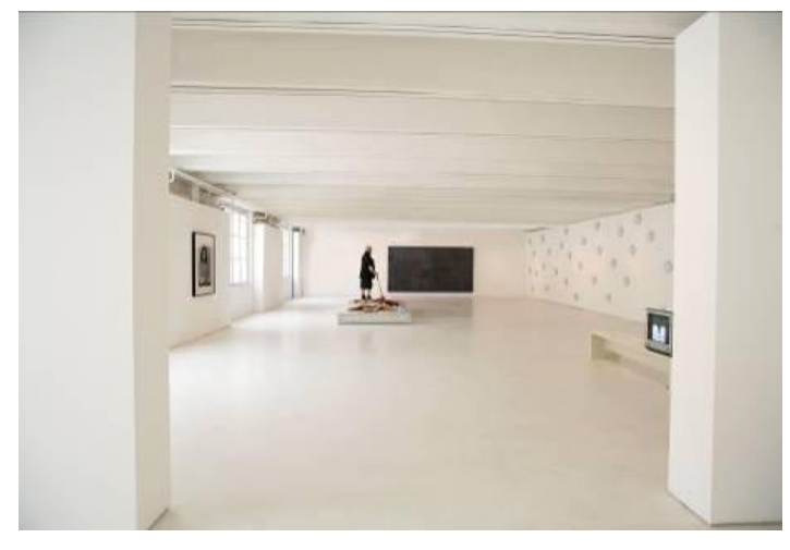
19 Urs Luthi 3 november - 2 december 2007