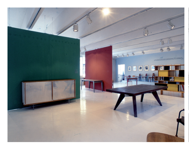
09 Jean Prouvé 12 - 22 april 2000