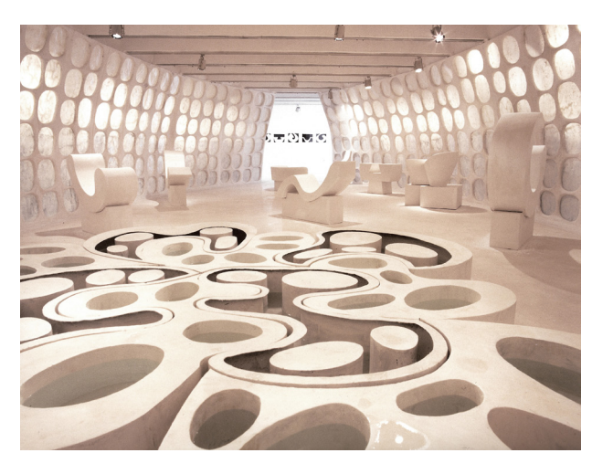
17 Kris Ruhs "Installation" 4 april - 6 may 2001