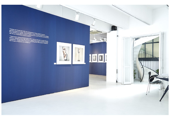
08 David Seidner 3 september - 13 november 2016